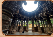
Kopeshwar Temple Khidrapur